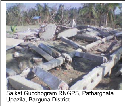
Saikat Gucchogram RNGPS, Patharghata Upazila, Barguna District