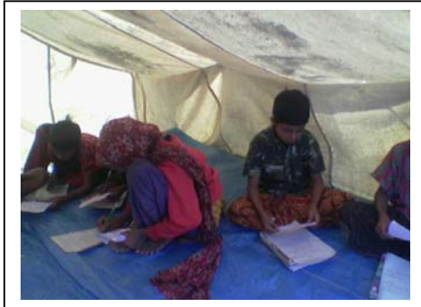
Children in a tent classroom after their school had been destroyed. Saikat Guchoqram RNGPS, Patharghata Upazila, Barguna District

At the time of the assessment, 78 percent of pre-primary, 83 percent of primary and 67 percent of secondary education institutions were functions to some degree. This could mean that the school was operating in the regular classroom, in a tent or under a tree.