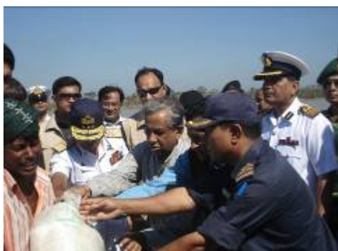
Honorable Chief Advisor distributing relief among the Sidr victims

AFD is working on non-stop basis and carrying the relief goods to the local administrations, communities at the very remote locations by both BAF and US Aircrafts. Today 07 air sorties were carried out by BAF with 21.38 tonnes of relief goods. Up to 27 November 2007 they have carried 783 tonnes relief items by 165 sorties.