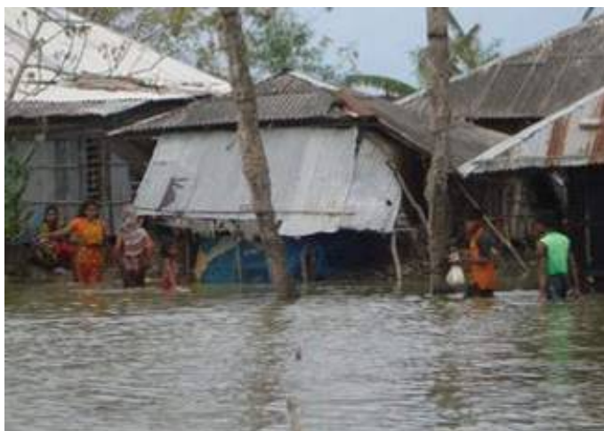
AILA affected area

Shayamnagar and Asasuni upazila were affected by wind driven surge which was 4-5 feet above normal astronomical tide. 9 unions of Shayamnagar and Asasuni were flooded adversely. Total 88 km of ring embankments damaged and 1 lakh people were affected in these 2 upazilas. 96 and 40 shelters were opened in Shayamnagar and Asasuni upazilas respectively. Dwellers of Kaliganj and Debhata upazila were also water logged. Army, Navy, Coast Guard and volunteers of different Government and non-government organizations have been involved in rescuing, relief and rehabilitation.